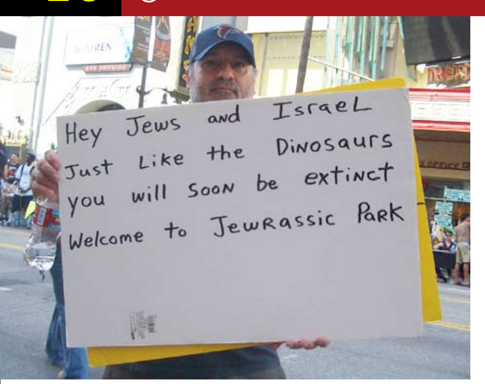
Anti-Israel rally - Los Angeles

The One-State solution, promoted by academics, is a non-starter because it would eliminate the Jewish homeland. However, the current pressures on Israel are equally dangerous. In effect, the world is demanding that Israel, the size of New Jersey, shrink further by accepting a Three-State solution: a PA state on the West Bank and a Hamas terrorist state controlling 1.5 million Palestinians in Gaza. All this, as Hezbollah, Iran's proxy in Lebanon, stockpiles 50,000 rockets, threatening northern and central Israel's main population centers.