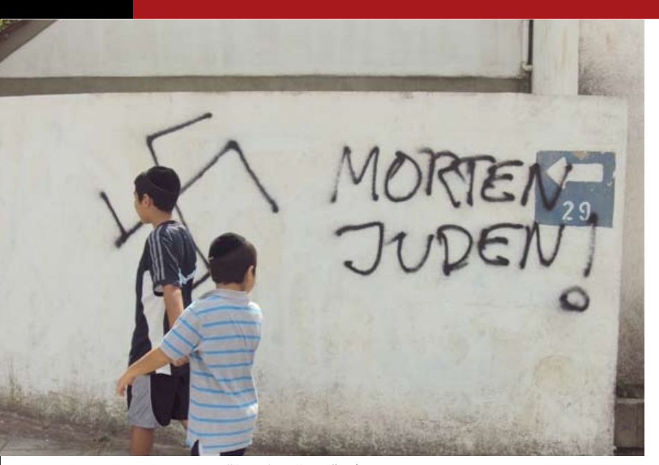
"Death to Jews!" - Argentina

From the Inquisition to the pogroms, to the 6,000,000 Jews murdered by the Nazis, history proves that Jew-hatred existed on a global scale before the creation of the State of Israel. In 2010, it would still exist even if Israel had never been created. For example, one poll indicates 40% of Europeans blame the recent global economic crisis on "Jews having too much economic power," a canard that has nothing to do with Israel.