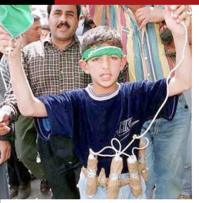
Glorifying Terrorism - Gaza City

The Palestinians themselves are the only stumbling block to achieving a Two-State solution. With whom should Israel negotiate? With President Abbas, who, for four years, has been barred by Hamas from visiting 1.5 million constituents in Gaza? With his Palestinian Authority, which continues to glorify terrorists and preaches hate in its educational system and the media? With Hamas, whose Iranian-backed leaders deny the Holocaust and use fanatical Jihadist rhetoric to call for Israel's destruction?