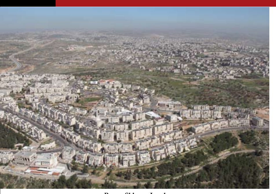
Ramat Shlomo, Israel

Enemies of Israel, exploit this phony issue. Jerusalem is holy to three great faiths. Its diverse population includes a Jewish majority with Muslim and Christian minorities. Since 1967, for the first time in history, there is full freedom of religion for all faiths in Jerusalem. Muslim and Christian religious bodies administer their own holy sites. Indeed, the Waqf is allowed to control Jerusalem's Temple Mount, even though it rests on Solomon's temple and is holy to BOTH Jews and Muslims.