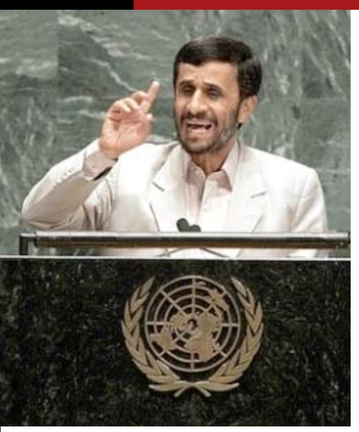
Ahmadinejad at UN

Though never acknowledged by Jerusalem, it is generally assumed that Israel has nuclear weapons. But unlike Pakistan, India, and North Korea, Israel never conducted nuclear tests. In 1973, when its very survival was imperiled by the surprise Egyptian-Syrian Yom Kippur attack, many assumed Israel would use nuclear weapons--but it did not. Contrary to public condemnations, many Arab leaders privately express relief that Israeli nuclear deterrence exists. While Israel has never threatened anyone, Tehran's mullahs daily threaten to "wipe Israel from the map." The U.S. and Europe can afford to wait to see what the Iranian regime does with its nuclear ambitions. But Israel cannot. She is on the front lines and remembers every day the price the Jewish people paid for not taking Hitler at his word. Israel is not prepared to sacrifice another six million Jews on the altar of the world's indifference.